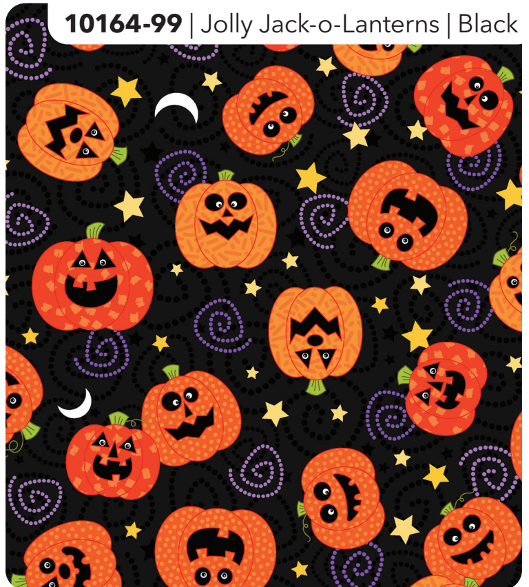
10164-99 | Jolly Jack-o-Lanterns | Black