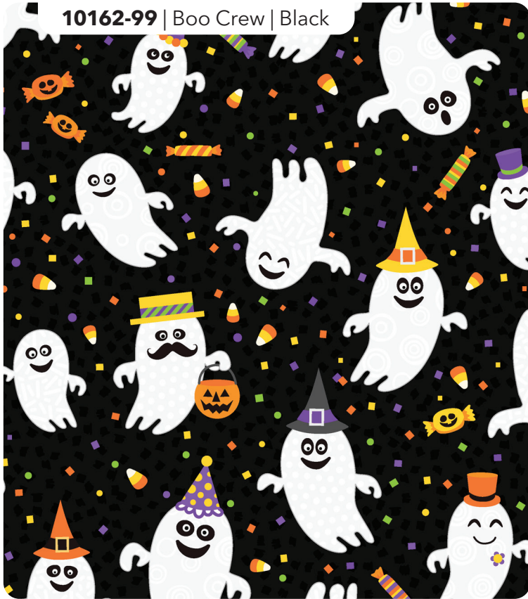
10162-99 | Boo Crew | Black