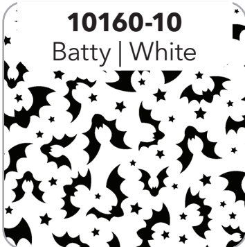
10160-10 Batty | White