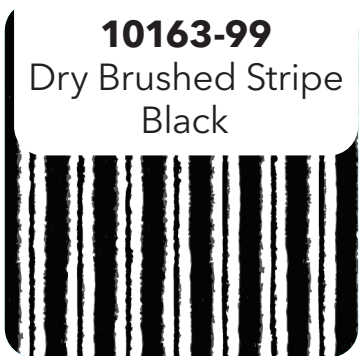
10163-99 Dry Brushed Stripe Black