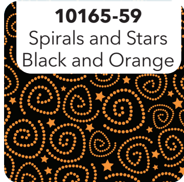
10165-59 Spirals and Stars Black and Orange